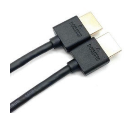
Cat. No: HDMIV20-1